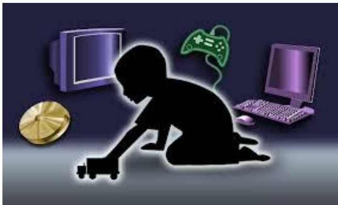
Children & Technology Addiction